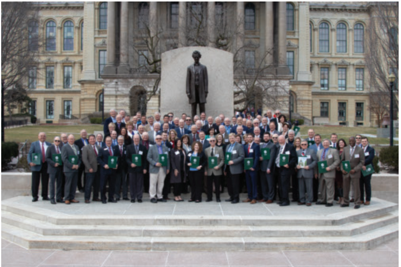
Illinois electric cooperative directors, managers and staff come together to discuss issues with the state legislators.