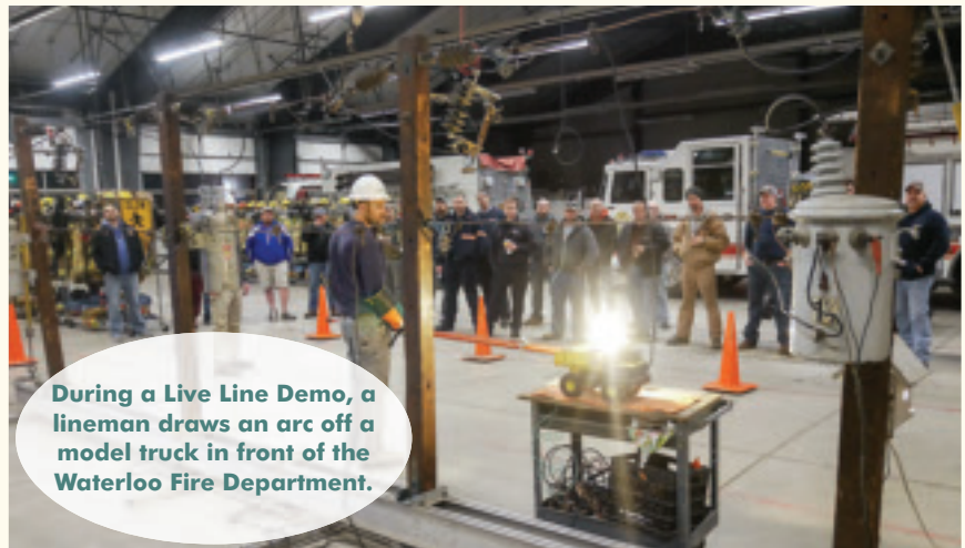
During a Live Line Demo, a lineman draws an arc off a model truck in front of the Waterloo Fire Department.

Working with electricity is an inherently dangerous job, especially for lineworkers. MCEC has a team that focuses on keeping our employees and the community safe around electricity. We established and follow safety protocols based on leading national safety practices for the utility industry. We require our lineworkers to wear specialized equipment when working next to or with power lines. There are specific protocols that our lineworkers follow when dealing with electricity. Our safety team has regular meetings where they discuss upcoming projects