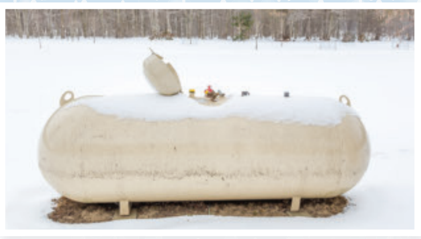
Keeping your propane tank free from snow and ice will allow your propane provider safe and easy access to service your tank.

Frequently check where snow or ice collect on your roof, structure, or