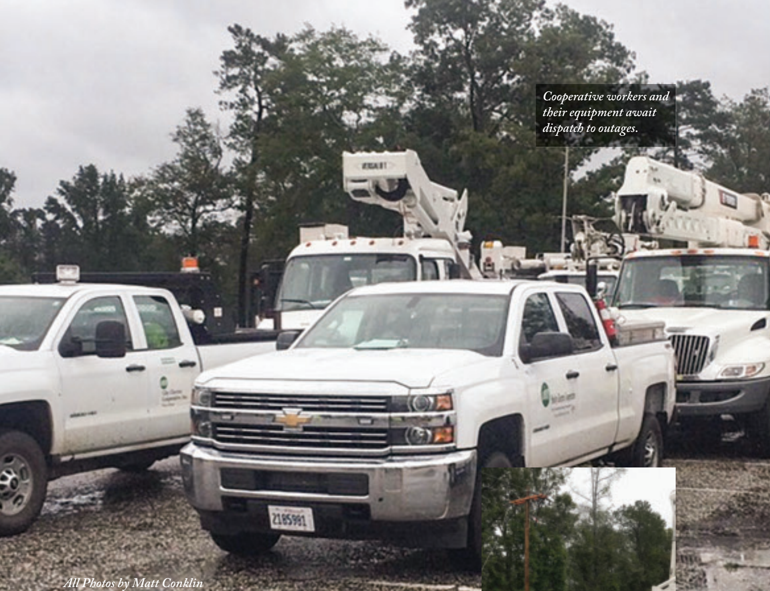
Cooperative workers and their equipment await dispatch to outages.