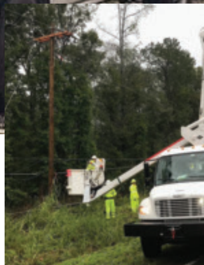
Wind damage fells trees and poles, cooperative linemen work hard to restore service and clear the lines.

Hurricane Florence left a third of a million members without power in the Carolinas' cooperative territories. Clay Electric's relief crew spent more than a week in North Carolina working 17-hour days to help the members left without power. We are grateful for their willingness