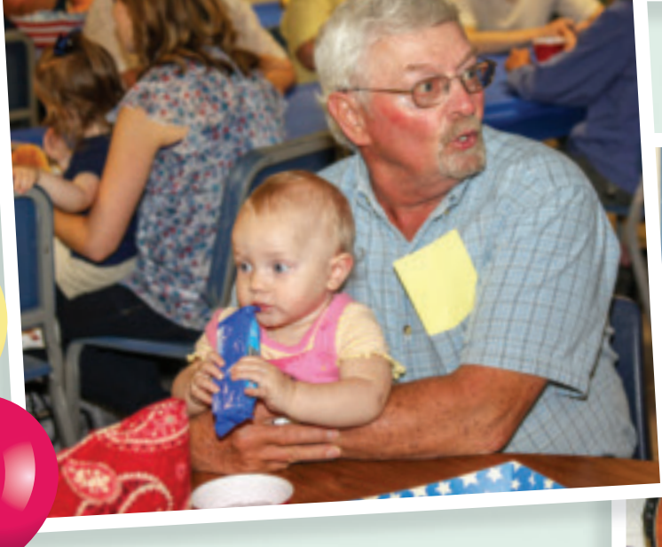
↑ The grilled pork chop dinner never disappoints and in a survey was marked as the #1 reason for attending the meeting; although this little gal seems to be happy with just the extra cookies.