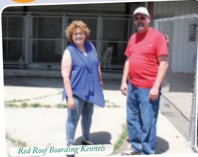
Red Roof Boarding Kennels