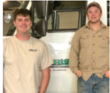
Norris Electric Cooperative.

Congratulations to both, and we wish for you a long fulfilling career at