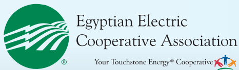
Illustration by Erin Binkley