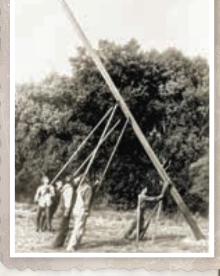
In the early days, poles were set by hand.

When Shelby Electric Cooperative was first established 80 years ago, the co-op served 481 member-owners in the following three counties: Christian, Macon, and Shelby. Today, your cooperative serves more than 10,000 member-owners in all or parts of these nine counties: Christian, Cumberland, Effingham, Fayette, Macon, Montgomery, Moultrie, Sangamon, and Shelby.