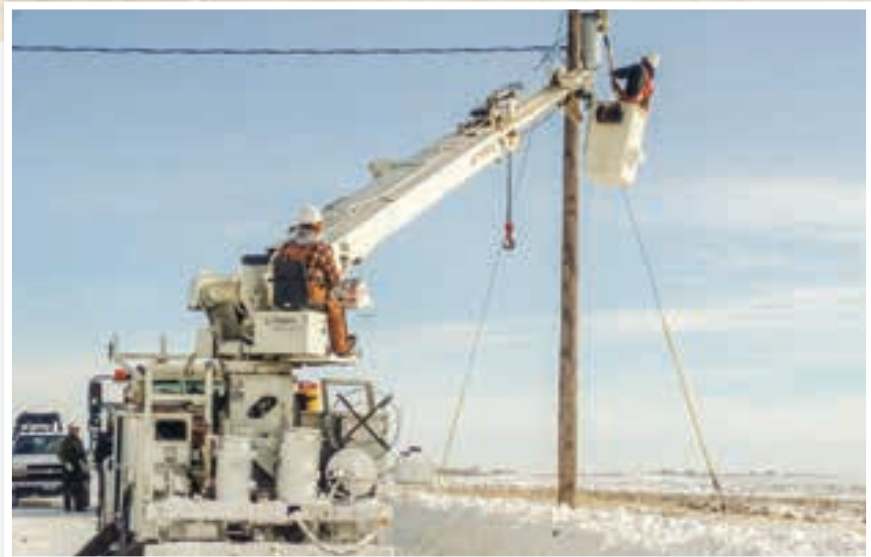
Even though linemen can still be found climbing poles, over the years, hydraulics and bucket trucks improved the safety and efficiency in building out and maintaining the cooperative's distribution system.

Shelby Electric Cooperative first energized 169 miles of line. Today, the cooperative has over 2,100 miles of energized line.