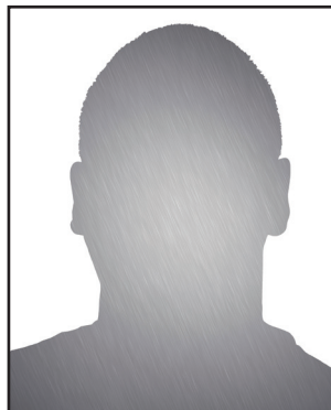
Open Director, District 2