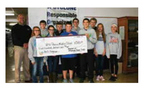
West Prairie Middle School - $500 Positive Behavioral Interventions & Supports (PBIS) Program