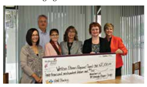
Western Illinois Regional Council Community Action Agency-$2,100 Food Pantry