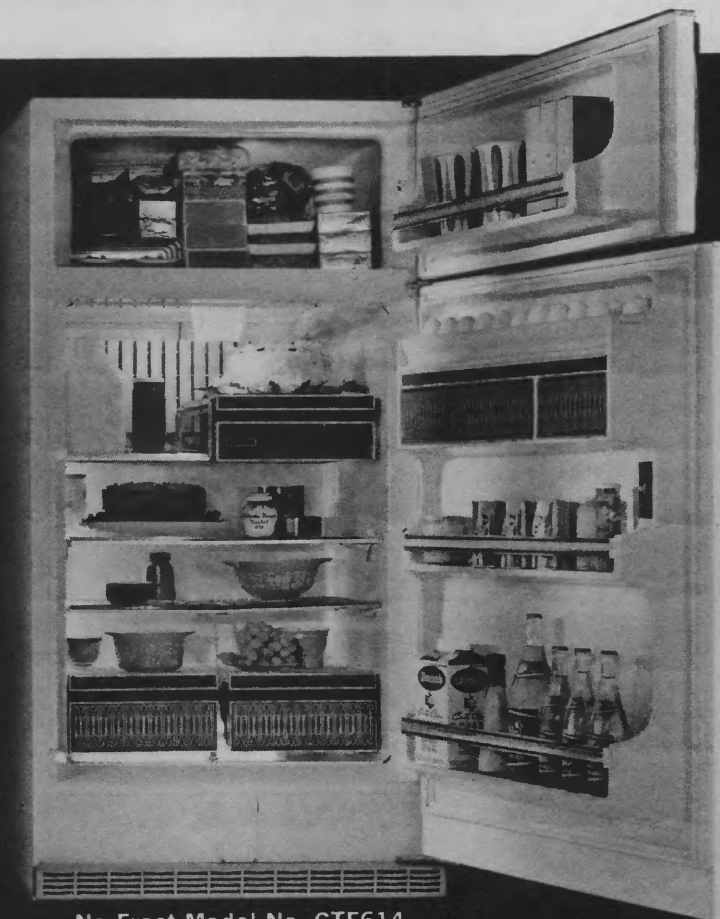
No-Frost Model No. CTF614

ROLLS OUT ON WHEELS FOR EASY CLEANING, SWEEPING AND WAXING