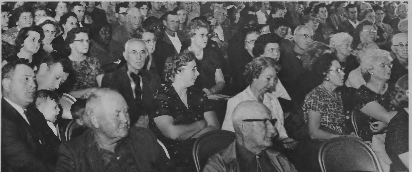
Some of the 600 persons who attended the annual meeting listen to reports of cooperative officers.