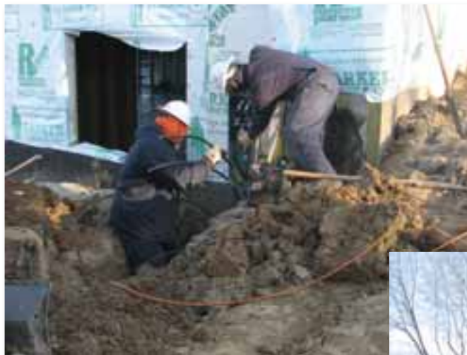
Right: Rock Energy's gas crew installs a natural gas line at a home under construction in Lake Summerset near Davis.