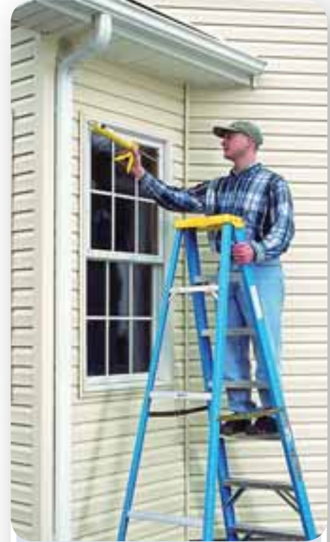
Caulking around window and door frames can reduce air leaks and drafts.

A drafty home will not only cost you more to heat, it's also less comfortable and may give you the urge to turn your thermostat even higher to feel warmer. Call us today to schedule an energy assessment, at 438-6197. We want you to enjoy your home, whatever the weather.