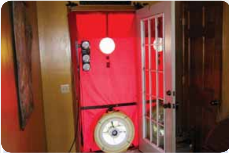
A blower door test helps find air leaks that cause higher heating bills as well as comfort problems.

Air leakage can occur around doors with no weather stripping, windows with bad seals, pipes or vents not caulked where they go through an outdoor wall, and many other common problem areas. We'll point out the best places to start your improvement projects, which are often low-cost or no-cost.