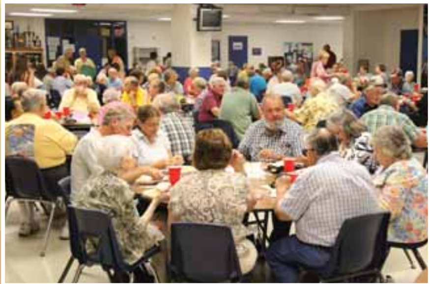
The Mason County Pork Producers prepared and served more than 700 dinners this year.

He talked about what a strong commitment to safety the co-op employees have, and how that combined with safer tools and increased training has led the co-op to achieve one of the best safety records among