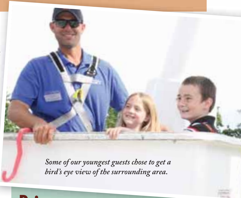
Some of our youngest guests chose to get a bird's eye view of the surrounding area.