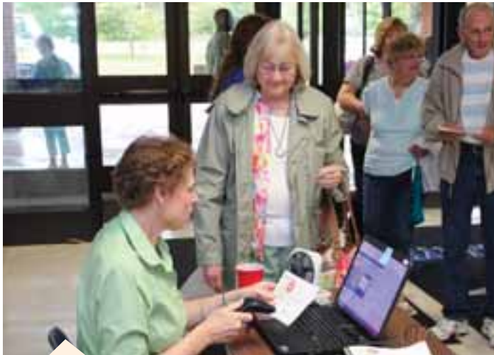
We utilized a new digital barcode scanning registration process this year that proved to be much faster, and popular with members. Those who brought their registration card received a $10 bill credit.