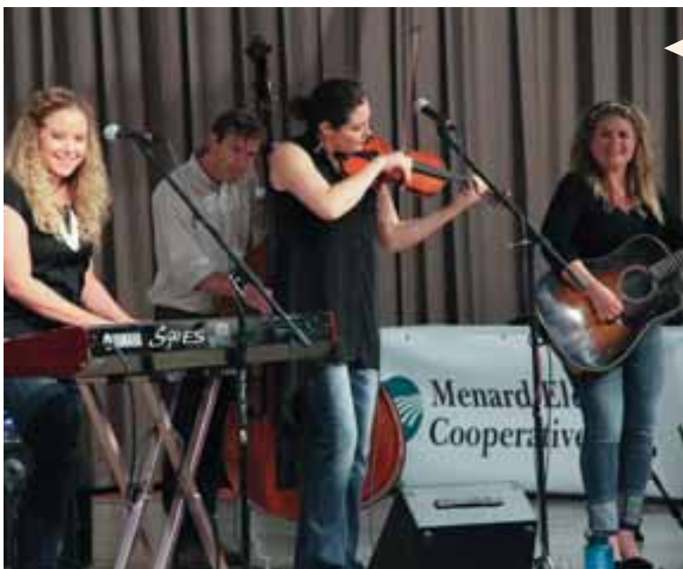
High Road III, a Nashville gospel recording group, gave an outstanding performance.