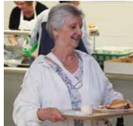
The Mason County Pork Producers always prepare an amazing meal! This year we served nearly 700 pork chop dinners.