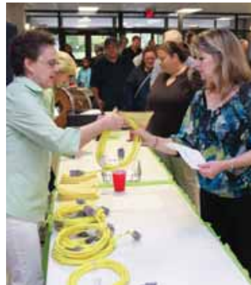
More than 340 members registered for the meeting and received a 15-foot extension cord.