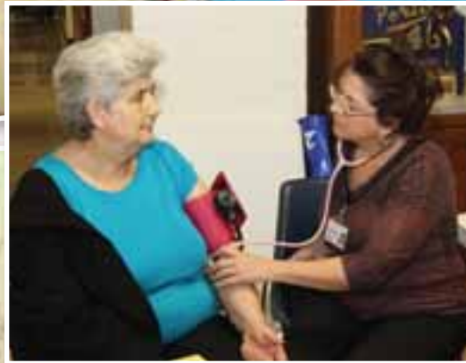
The Menard County Health Department gave blood pressure checks again this year.