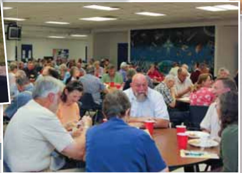
The pork chop dinner prepared by the Mason County Pork Producers is always popular. More than 650 dinners were served this year.