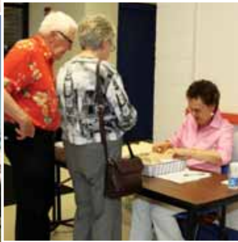
More than 300 members registered for the meeting and received a $10 bill credit.