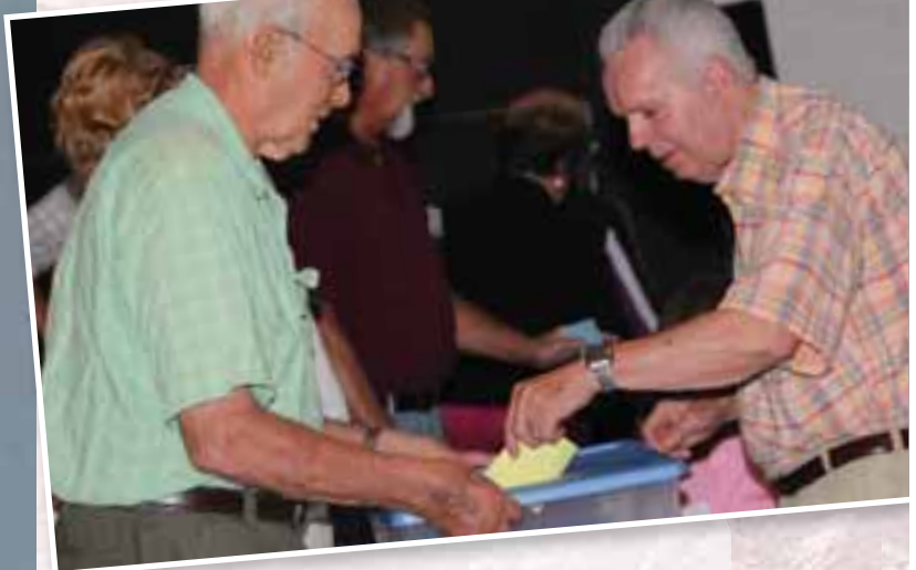
Members voted paper ballots for their representative in District 4.