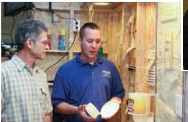
Representatives from Prairie Power Inc., our wholesale power provider, answered member questions about energy efficiency at The Energy Wall and handed out outlet sealers and weather stripping.