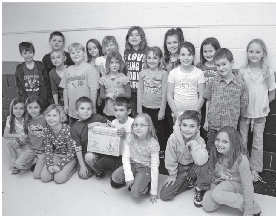
Students in Mrs. Fox's second-grade class at Virginia Elementary School show off their new Touchstone Energy Super Energy Saver Program.

A child's added weight to a tree branch can cause a limb to come into contact with nearby lines. Or a child could reach out to catch themselves and touch a line. Tell your kids which trees are safe to climb and what to watch out for.