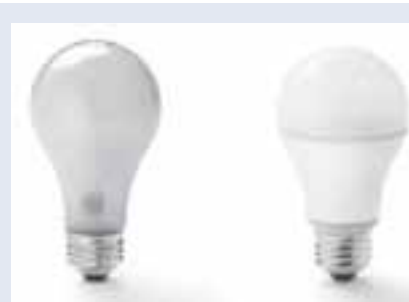
The energy saving 60-watt incandescent replacement LED bulb is engineered to have the familiar size and shape of an incandescent bulb while providing a crisp white light that brings out more vibrant colors and patterns.

Sources: EnergySavers.gov , Eastern Illini Electric Cooperative , EnergyStar.gov