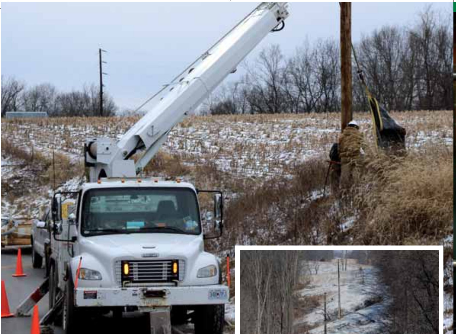
A crew with Croft Construction working near Hardin, IL.

The location of the line becomes particularly important during times of outages when it can take much longer to repair lines that are not accessible by truck. When possible, the new poles are being set closer to the road in the right-of-way.