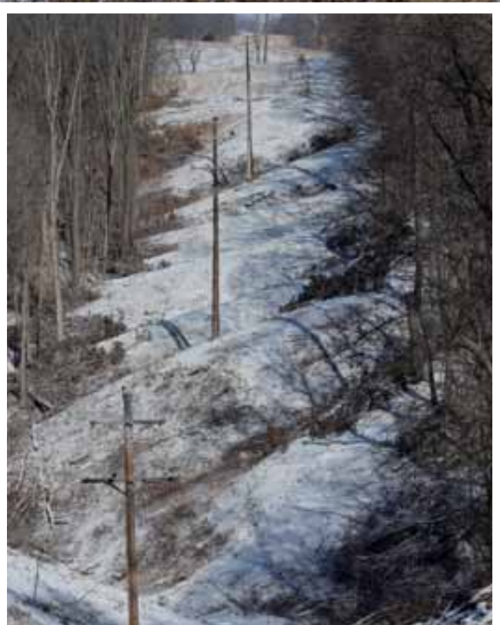
A section of the N Line in Calhoun county.

Phase two of the N Line rebuild is projected to be complete in June.