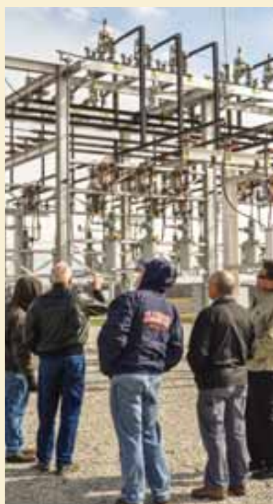
EnerStar board members and employees take cooperative training into the field to see the new Martinsville substation.

Your electric cooperative's board of directors are members just like you who were elected to serve the membership. They all have their own "day jobs" and do not work in the electric industry, so training and education is critical to helping them "wear their co-op hats."