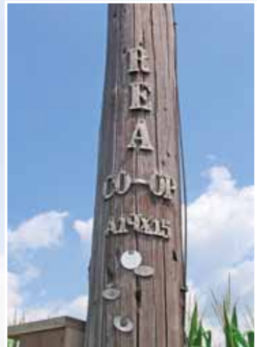
This old pole is still going strong! It is stamped with the REA information and the badges show the history of pole testing.

Do you or a family member remember when the lights came on for the first time? If so, we would love to hear your “then” stories! Please contact the cooperative at 1-800-635-4145. We would like to visit with you or your family member to share your story. The