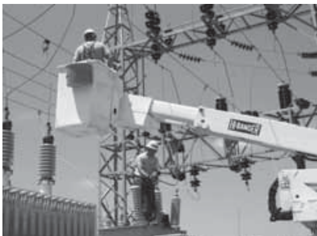
The pictures below and to the right show Clinton County Electric Cooperative Inc. (CCECI) linemen installing a 3750 KVA transformer at our Breese Substation. The addition of this transformer doubles the transformer capacity at the Breese Substation.

this plan will cost the Cooperative approximately $175,000 over a two year period. We believe this is a fairly priced insurance policy to ensure reliable power for many years to come.