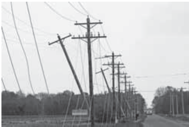
◀ In this photo, Big D Electric is preparing to pull line tight on the bottom circuit. The old energized line is leaning towards the field. This is done so the new line can be constructed without affecting members' power.

161, eventually tying into the Shattuc Substation. The estimated investment of this 4 year plan is approximately two million dollars and is scheduled to be completed by the end of 2015.