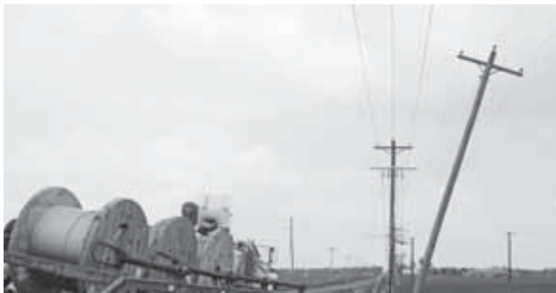
◀ The apparatus on the left side of the photo is called a string trailer. This trailer is used by crews to string 3-phase line safely, efficiently and effectively.