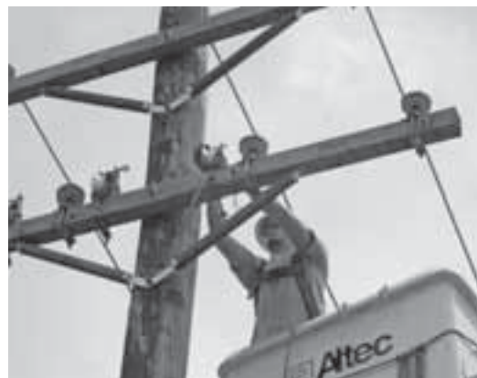
▲ Here a Big D Electric crew member is installing stringing pulleys to the newly constructed cross arm.