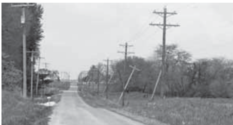
◀ This photo represents the finished product with the new line pulled and ready to be energized.