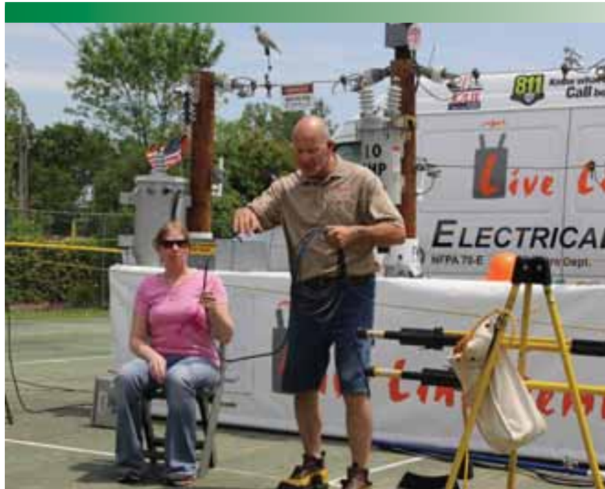
Don't miss the Live Line Demo at the Farm Progress Show in Decatur.