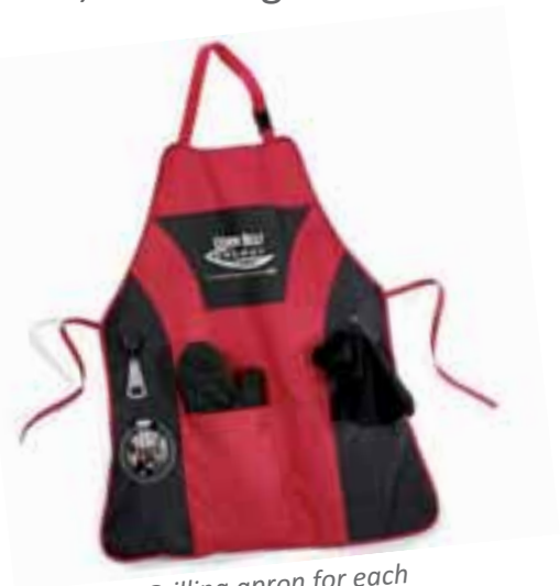
Grilling apron for each household that registers!

More details will appear in our Annual Report book which will be mailed to every member by early June. Inside, you'll find a complete agenda along with proposed bylaw changes and RSVP details for lunch.