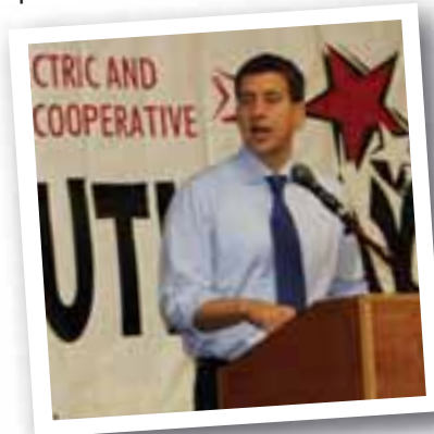
State Treasurer Alexi Giannoulias