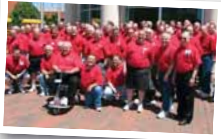
The Sound of Illinois Chorus is back by popular demand!

Bring the whole family and join us for lunch, great entertainment, and an opportunity to win great prizes.